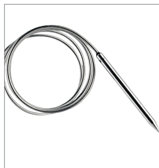
Stainless Steel Bendable RTD Probe (PT)