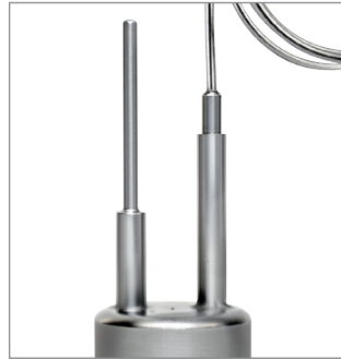
Rigid Transitional Diameter Probe (TD)

All HiTemp140X2 Series data loggers feature two temperature channels. The channel number for each probe is identified on the top of the logger as shown to the right.