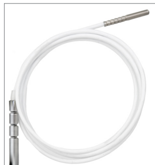
Flexible RTD Probe (FP)