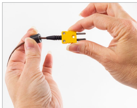
Step 2: Move the ferrite core close to the connector