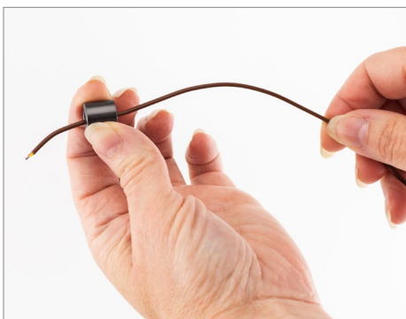
Step 1: String the ferrite core onto the thermocouple

Using the TC101A with an external probe routed through the ferrite core twice, the TC101A tested against RTCA/DO-160G for Emission of Radio Frequency Energy with satisfactory results.