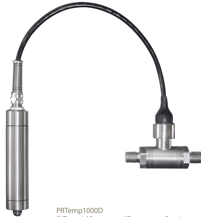
PRTemp1000D Differential Pressure and Temperature Data Logger