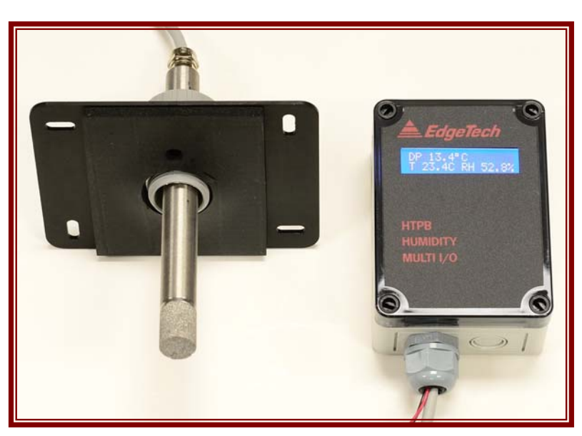
HT60D Duct Mount