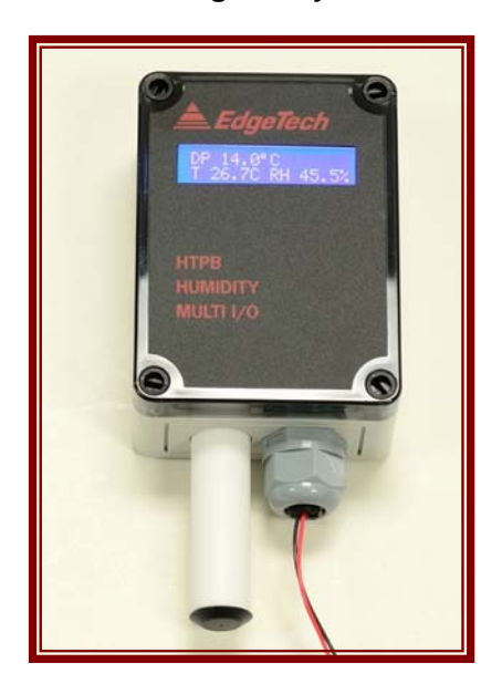
HT60W Wall Mount

is a transmitter for humidity, temperature and dew point or barometric pressure applications and offers many other psychometric calculations. The three measurements in one probe allows the end-user flexibility where space constraints are a concern. The series is configured for wall and duct applications and offers field replaceable sensor tips where interchangeability is within \pm 1\% .