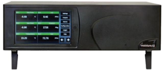
Bench mount version

The moisture.IQ can accept inputs from the Panametrics MIS probes and the M Series probes that were available for the Moisture Image Series 1 and Moisture Monitor Series 3 analyzers. The MIS probes (MISP and MISP2) provide integral moisture, temperature, and pressure inputs. The calibration data for these sensors is stored digitally. Upon connection to the analyzer, the calibration data is downloaded to the moisture.IQ.